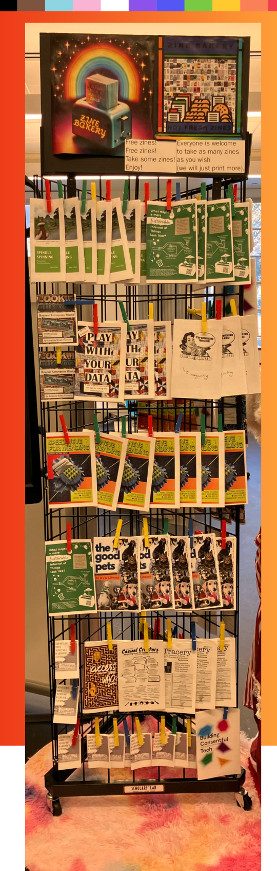
1 of Scholars' Lab's 2 public zine racks.